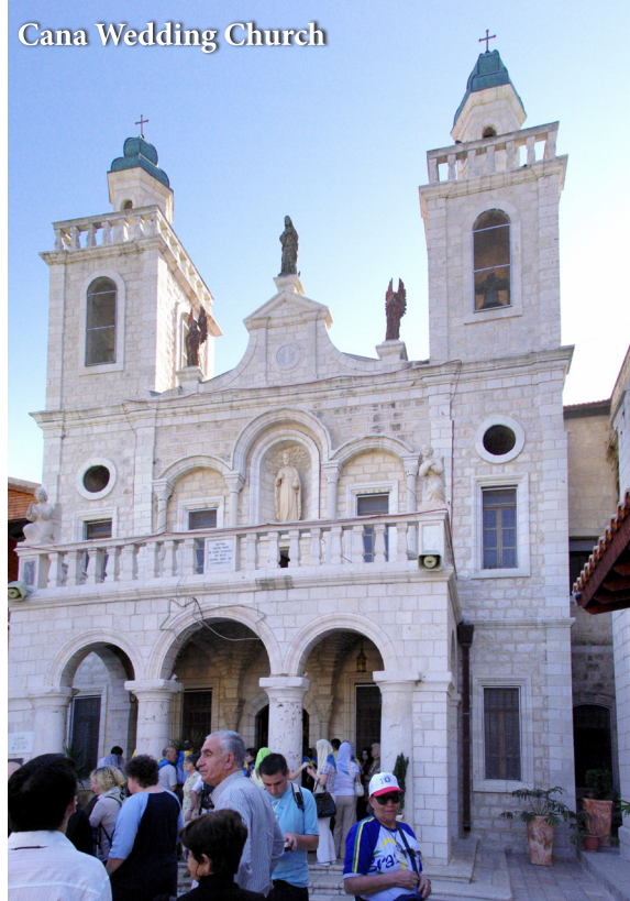
Cana Wedding Church

continue to Tel Megiddo, the site scholars have identified as the Valley of the Armageddon. In Tel Megiddo, we will visit archaeological excavations and the old water supply system (1 Kings 4:28, 9, 15, 2 Kings 23, 29 & Revel. 16:16). Our next stop is Mount Carmel (Muhiraka), the site of confrontation between Elijah and the prophets of Baal (1 King 18:20-40), enjoying the fantastic view of the Jezreel Valley and the lower Galilee. This would be an opportune time to enjoy lunch in the Carmel area. Stop in Haifa before we continue to Jerusalem. Dinner and overnight accommodations will be at your hotel in Jerusalem.